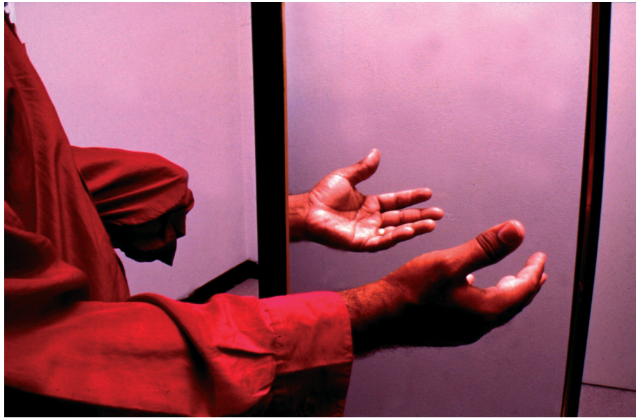
Fig 2. Mirror visual feedback (MVF) in a patient with an amputated left arm.

in the phantom occurred if the experimenter's hand was substituted for the patient's normal hand. Such effects were not seen in four control subjects given identical instructions.